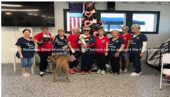
South Gulf Cove 5k to support local animal rescue groups