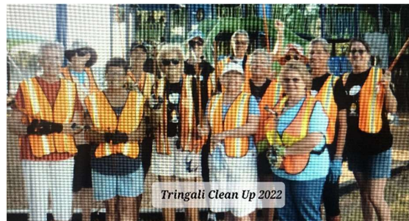
Earth Day Tringali Park Cleanup Part of the Great American Cleanup